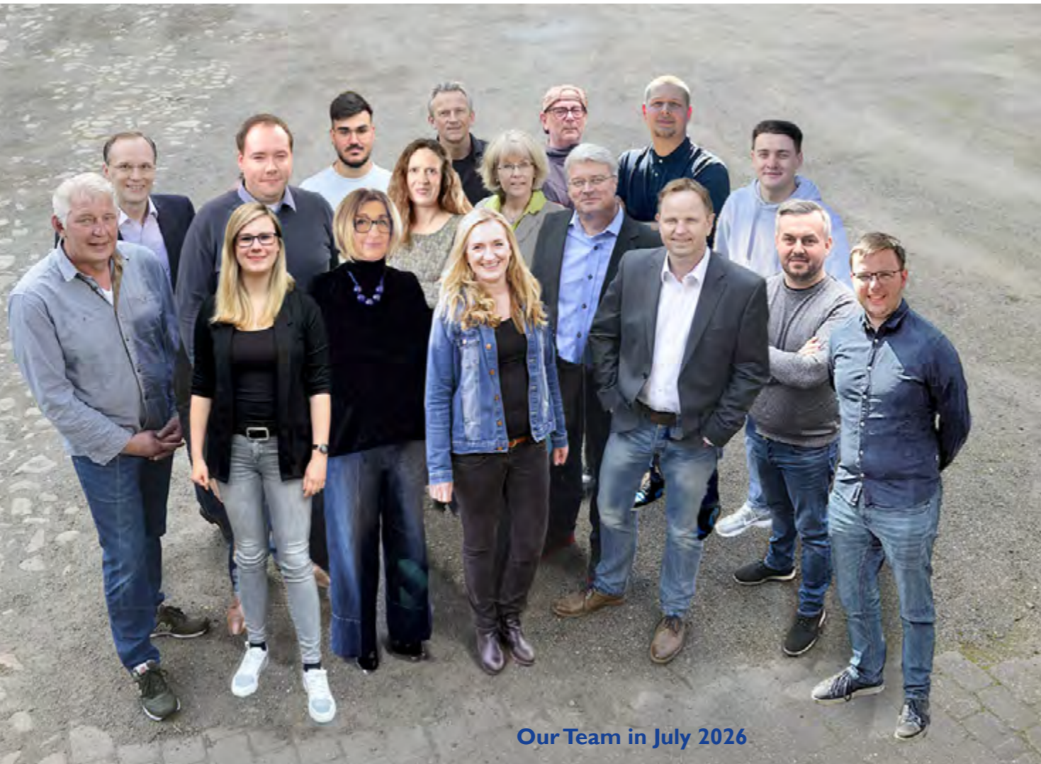
Our Team in July 2026

Our company is an equal opportunity employer, with each employee contributing his or her own personal share. Our decision-making paths are short, the level of empowerment high, and the ability of looking beyond the horizon of just one's own job is considered standard. We're by no means just pencil pushers, but are ready to be out there, on site – for you and your projects!