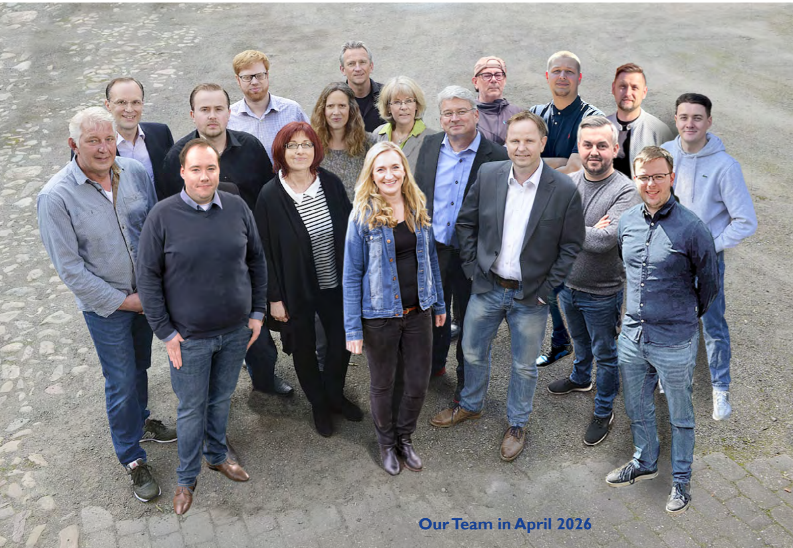
Our Team in April 2026

Our company is an equal opportunity employer, with each employee contributing his or her own personal share. Our decision-making paths are short, the level of empowerment high, and the ability of looking beyond the horizon of just one's own job is considered standard. We're by no means just pencil pushers, but are ready to be out there, on site – for you and your projects!