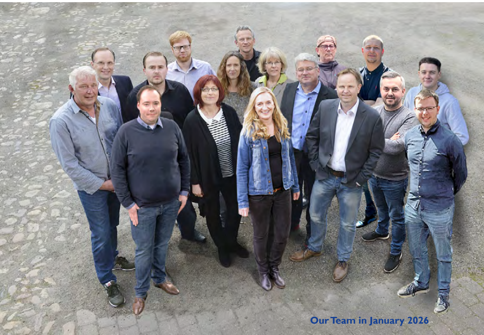
Our Team in January 2026

Our company is an equal opportunity employer, with each employee contributing his or her own personal share. Our decision-making paths are short, the level of empowerment high, and the ability of looking beyond the horizon of just one's own job is considered standard. We're by no means just pencil pushers, but are ready to be out there, on site – for you and your projects!