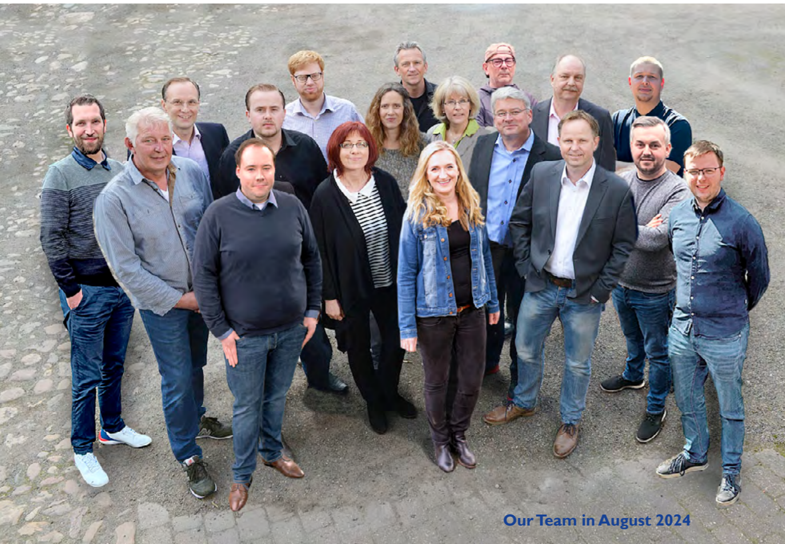
Our Team in August 2024

Our company is an equal opportunity employer, with each employee contributing his or her own personal share. Our decision-making paths are short, the level of empowerment high, and the ability of looking beyond the horizon of just one's own job is considered standard. We're by no means just pencil pushers, but are ready to be out there, on site – for you and your projects!