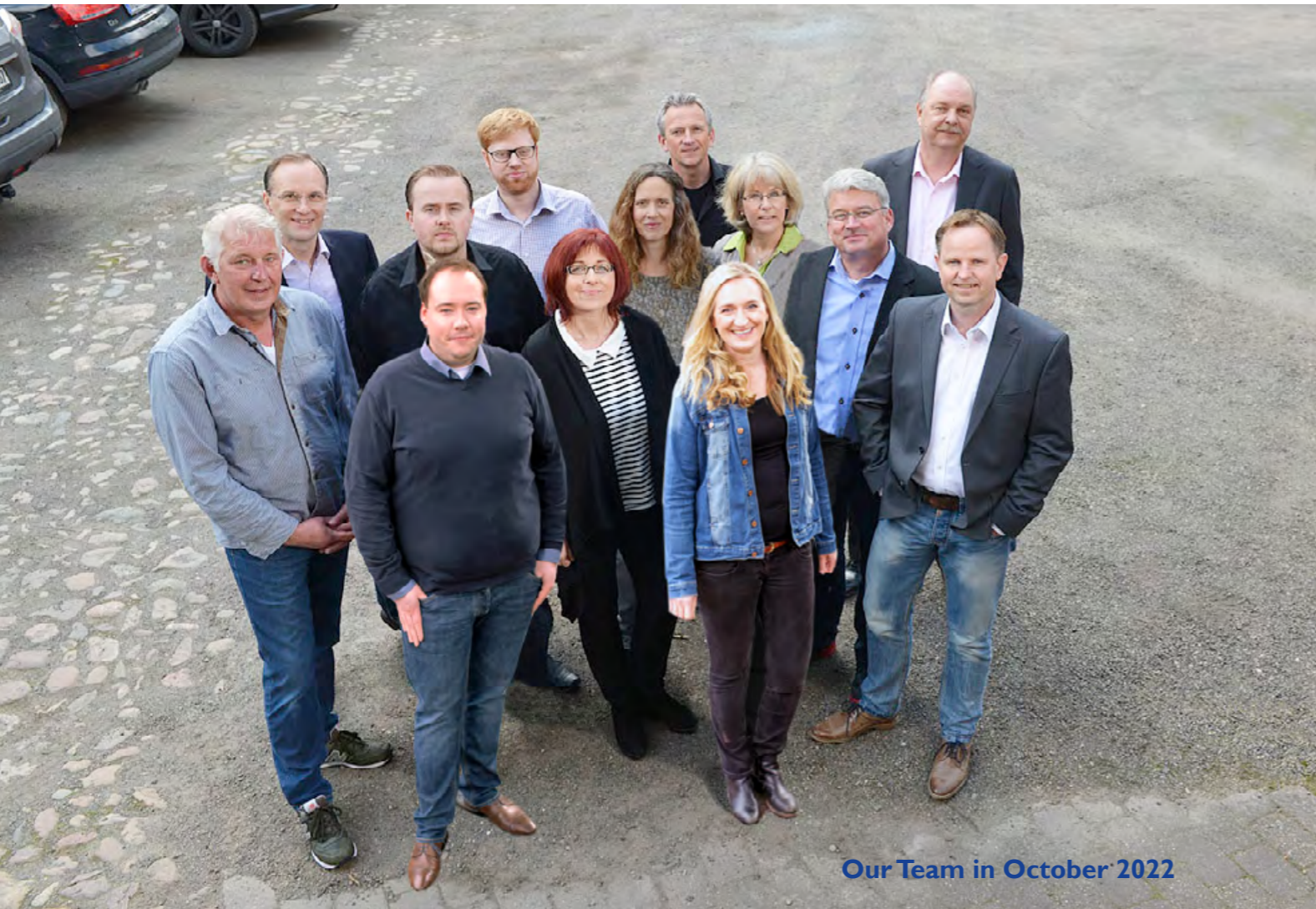
Our Team in October 2022

Our company is an equal opportunity employer, with each employee contributing his or her own personal share. Our decision-making paths are short, the level of empowerment high, and the ability of looking beyond the horizon of just one's own job is considered standard. We're by no means just pencil pushers, but are ready to be out there, on site – for you and your projects!